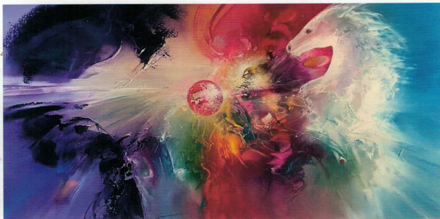
Vjekoslav Nemesh, Pegasus Game Changer , oil on canvas

In My Bubble , a group exhibition, runs to 10 September, and Nancy Tschetner's Texture and Contrast , The Beauty Surrounding Us , runs from 11 September to 8 October at The Art Lounge NZ, Tauranga. theartlounge.nz